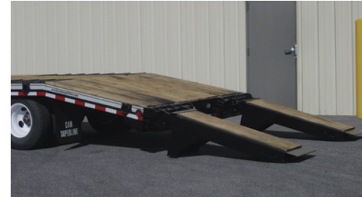
Wood Filled Ramps