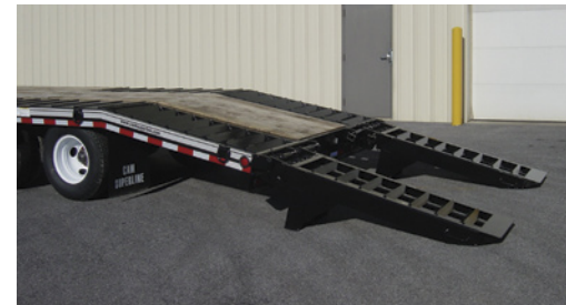
Self Clean Beavertail & Ramps