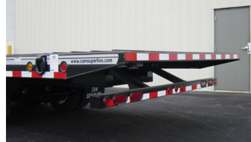
Rear Impact Guard