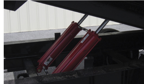
Dual 4" Cushion Cylinders