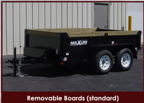
Removable Boards (standard)